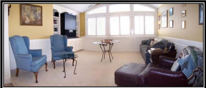
The gameroom is convenient to the upstairs secondary bedrooms offering a spacious get-away. It has paneled wainscoting, built-in area for entertainment systems, plantation shuttered windows, ceiling fan and built-in speakers.