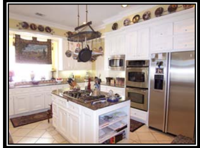
Wonderful floorplan with three living areas (gameroom up), a study, master bedroom on first floor and three secondary bedrooms upstairs. Secondary staircase leads from kitchen area.