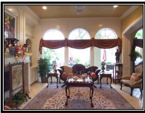
Formals have wall of windows overlooking the landscaped yard and lake.

Put "PRU4F5N3" into the Yahoo search box for more details on this home including a visual tour.